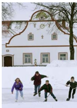
Children skating on a frozen pond in the south Bohemian village of Holasovice, well-known for its unique 19th century Baroque architecture.

positions put in place. Then expect action plans to be carried out to the letter. Flexibility and improvisation are not Czech business attributes. This means that renegotiation of agreed points may often be seen as a breach of trust.