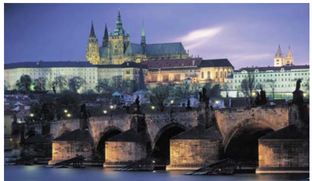
The Charles Bridge and Prague Castle

Top five UK exports: in 2003, these were (in decreasing order): electrical machinery/apparatus, general industrial machinery and equipment, office and automatic data processing machines, non-ferrous metals and road vehicles. In 2002, the UK exported £1.03bn to the Czech Republic.