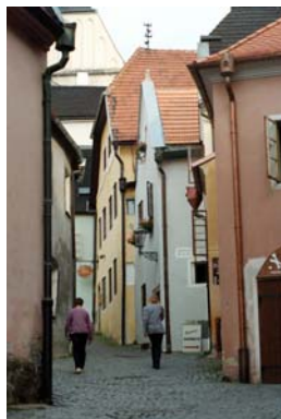
Picture of the UNESCO protected historical downtown of the town of Cesky Krumlov, south Bohemia, Czech Republic.

The Czechs are a plain-spoken, even-tempered people, revealing a spectrum of cultural, religious and political influences that is surprisingly broad for such a small country – from German and Austrian to Polish and Hungarian, from liberal to deeply traditional, global-thinking to fiercely nationalistic. Czech art and architecture is famous, but Czechs have also excelled at less noticeable art forms, such as illuminated manuscripts, religious sculptures, and marionette and puppet theatre. The latter was officially approved even in the communist era, and Czech performances rank among the best in the world.