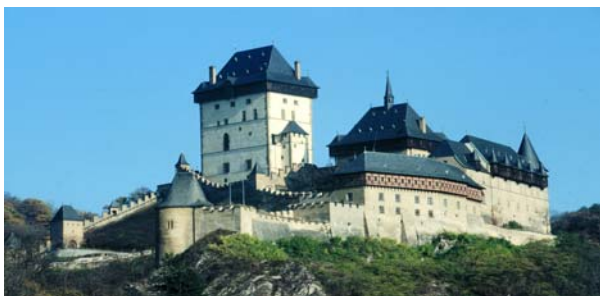
Castle Karlstejn, some 25 km west of Prague. The Gothic castle built in 1348 has a unique position among Czech castles. Czech King and Roman Emperor Charles IV used it as a place for safekeeping of the royal treasures, especially Charles's collection of holy relics and the coronation jewels of the Roman Empire.

Finding translators/interpreters: in the UK, you can search for local, quality-assured providers on BLIS Professionals ( www.blis.org.uk/professionals ). In the Czech Republic, translators and interpreters are readily available – the best place to enquire is at the British Embassy.