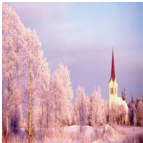
Joelahtme church established in the 14 th century

Estonia today: Estonia is the northernmost Baltic State and with a population of only 1.4 million, it is also the smallest. On 20 August 1991 Estonia re-established independence and in 1994 the last Russian troops withdrew from the country. Rapid development of the communications infrastructure followed and the capital city, Tallinn, is now particularly technologically advanced and produces half of the country's GDP. Estonia has done well since gaining independence due to its favourable location and strong Scandinavian links, particularly with Finland and Sweden. An excellent business environment and conditions for production, liberal