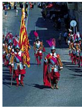
One of Malta's many festivals – celebrating 7,000 years of culture on the island of Gozo.

Feb 3 - Feb 8: Carnival Mar 10 - 13: Mediterranean Food Festival Mar 20 - 27: Holy Week May 6 - 7: Fireworks Festival July 15 - 17: Jazz Festival Sep 24 - 25: Malta International Airshow Oct 6 - Oct 16: The Malta Historic Cities Festival Oct 22 - 29: The Rolex Middle Sea Race Nov 7 - 11: International Choir Festival