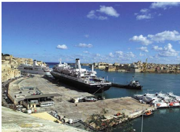
Cruise liners in the Grand Harbour of Valletta.

Phoenicians, Carthaginians and Romans left their traces, to be followed by Arabs and Normans. The Knights of the order of St John made the island their headquarters from the 16 th century and built great fortifications, palaces, public buildings and St John's Cathedral with its eight ornate chapels dedicated to each of the lingues or nations of the Order.