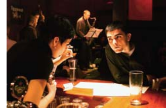
Above, guests enjoying themselves in the jazz club Tygmont in downtown Warsaw.

■ Cultured. Krakow, Poland's third largest city, has been its cultural centre since the Middle Ages. In 2000, it was the Cultural City of Europe.