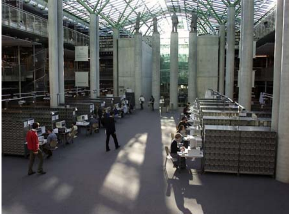
Above, view into the main hall of Warsaw's University Library.