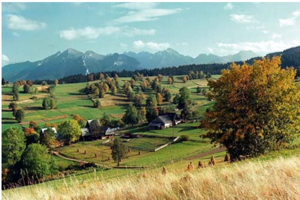
Above, countryside of the Tatra mountains near Zakopane.

Growth sectors: Automotive electronics, IT and telecoms, environment, food and food processing, infrastructure, tourism and financial services – the Warsaw Stock Exchange is now outpacing Western stock markets.