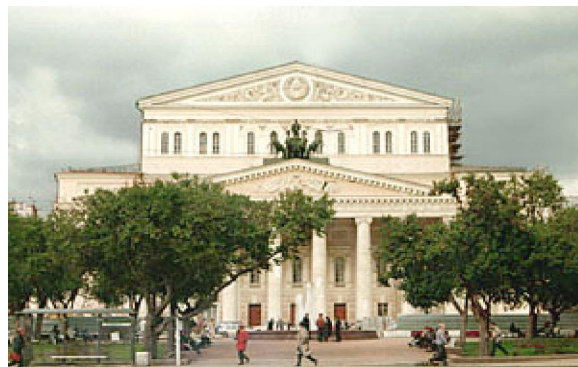
Bolshoi Theatre, Moscow